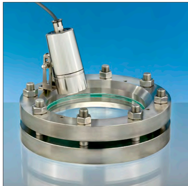
Application as combined sight and light port on a sight glass fitting acc. to DIN 28120, mounting by way of hinged bracket